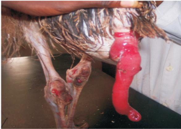
Figure 1: Emu showing prolapsed intestine